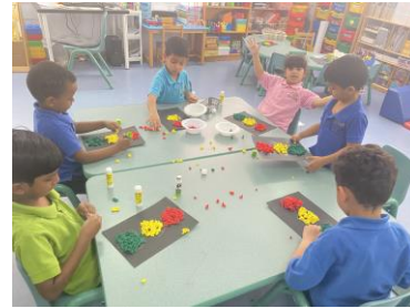
We were very good at remembering what the colours on a traffic light means.

We are practicing hard to make our teachers and family proud.