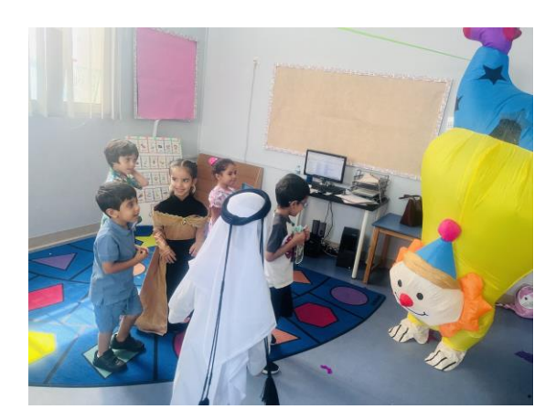
We had a surprise visit in our classroom from an upside-down clown who came to enjoy our end of the year party.