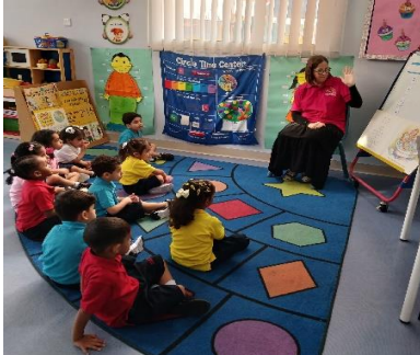
Enjoying story time, which included our weekly Maths activity of counting.