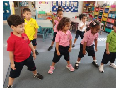
Playing Simple Simon says was so much fun! We used our listening ears to follow what he said.