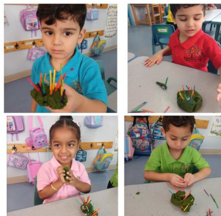
Playdough fun! Demonstrating our creativity in our Expressive Arts and Design activity.

It's going to be another fun-filled week!