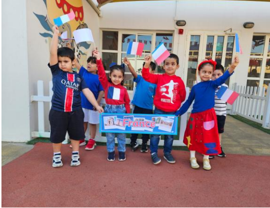
We looked so dashing in the colours of the French Flag.