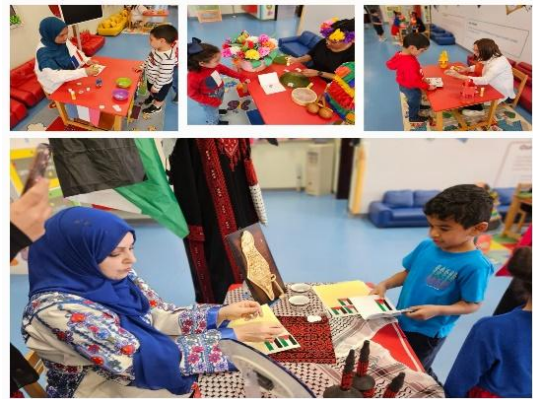
We had our passports stamped when we visited each immigration point 😊

The school will end at 12:30 p.m. on Tuesday 17 th December and there will be no late pick-up service.