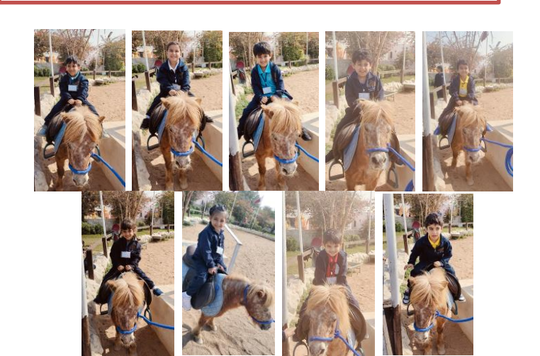
Who doesn't enjoy a pony ride to end off a wonderful day at the farm!

To help your children develop the habit of 'eating healthy', be their role models and make sure to: Remove unhealthy foods from the house, offer a variety of healthy foods, and present meals attractively.