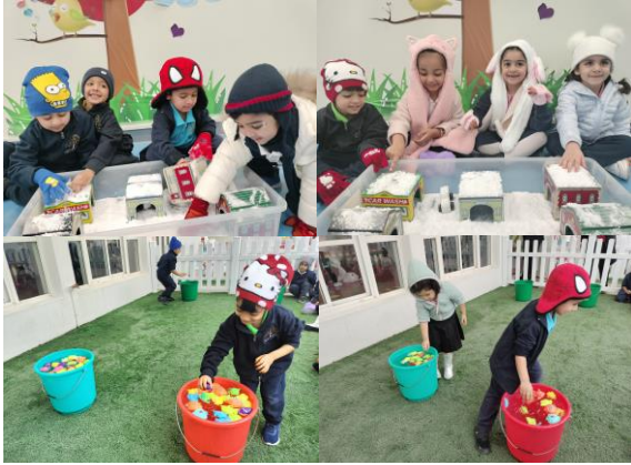
Winter fun and games started with some snow in the town fun, and ice fishing.